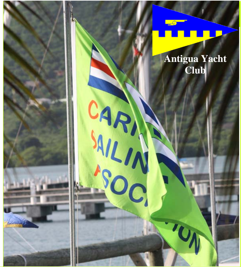
Antigua Yacht Club

Regatta Organisers Conference (ROC) 22 & 23 October 2011 St. Maarten